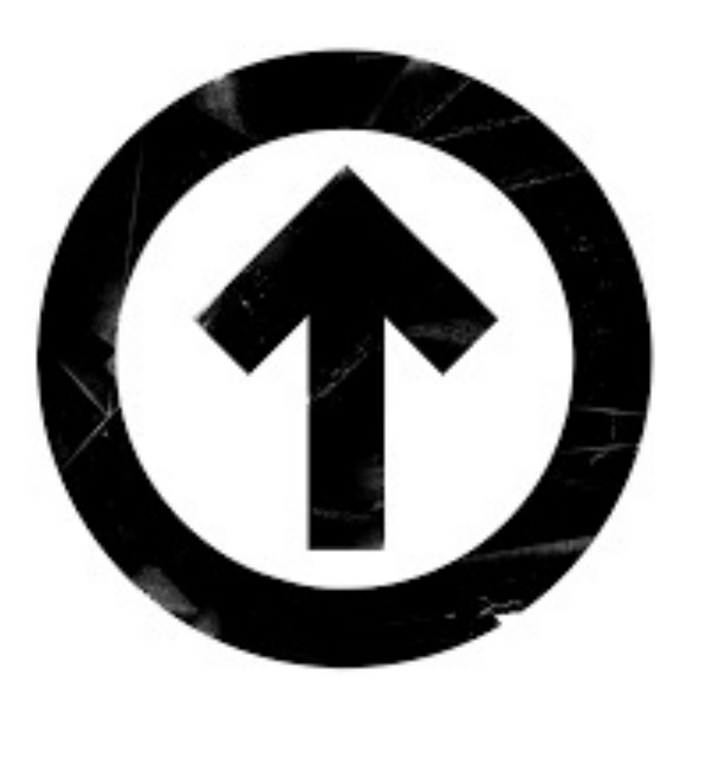
Figure 2. Logos of effective mass media substance use prevention campaigns

Research reported in this publication was supported by the National Institutes of Health under Award Numbers and U54DA036114. The content is solely the responsibility of the authors and does not necessarily represent the official views of the National Institutes of Health. The authors have no conflicts of interest to disclose