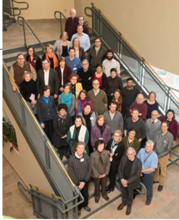
Annual UVM Cancer Center retreat

Produced by Creative Services at The University of Vermont Larner College of Medicine