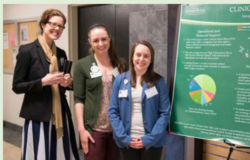
Members of the UVM Cancer Center Clinical Trials Office

A subset of patients with low-risk breast cancer is highly unlikely to see cancer return following breast conservation surgery but can lower that risk even further with radiation therapy, finds a new long-term clinical trial report. These 12-year follow-up data are the only prospective, randomized trial to compare recurrence outcomes after treatment for low-risk ductal carcinoma in situ (DCIS). To read the full report, visit astro.org .