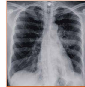
What is your diagnosis?